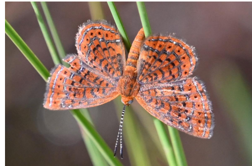
Little Metalmark , in habitat at Big Cypress Preserve.

Donations allow us to provide important conservation services such as improving our free online resources, increasing protection of rare plants and animals, restoring native ecosystems, and advocating for better public policy.